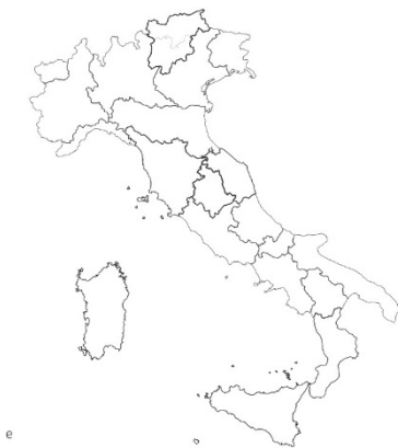
Italy map (August, 2021)

Fines vary from 400 to 1000 euro for violation of the current Italian Decree from not wearing masks to circulating in public if positive with Covid-19. Refer to Section 3 or 4B for current regional and national restrictions. Moreover, for those persons who are awaiting covid-19 test results or who are positive to the test who do not adhere to protocol can face penal sanctions with arrest.